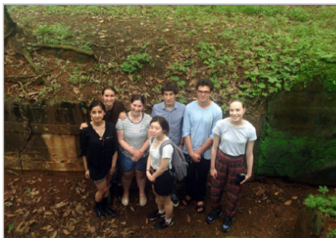
Simpson Prize Tour winners inside Australian artillery bunker at Nui Dat Task Force site